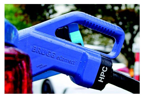
IP 67 certified Rollover resistant for passenger cars